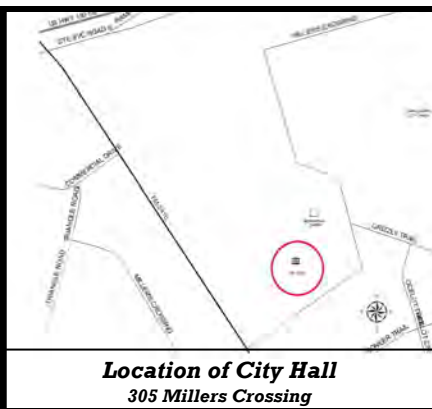
Location of City Hall 305 Millers Crossing

Setting up your water/sewer/garbage account with the City is a simple process. Just stop by the Finance Department at City Hall (305 Miller’s Crossing), fill out the necessary paperwork, and pay a $55.00 deposit, and your account (which includes water, sewer, garbage, and drainage charges) will be set up. The City does not provide trash cans so you will need to purchase your own. You are allowed up to 5 cans (20-44 gallons each). Billing for these services is monthly and payment can be mailed/delivered to City Hall, or taken along with your bill to First National Bank Texas locations in H.E.B. or Wal-Mart, or Market Heights. You can also take advantage of our convenient utility payment options by using our website: www.ci.harker-height.tx.us , our IVR system at 254-953-5630, or our payment kiosk (located at City Hall).